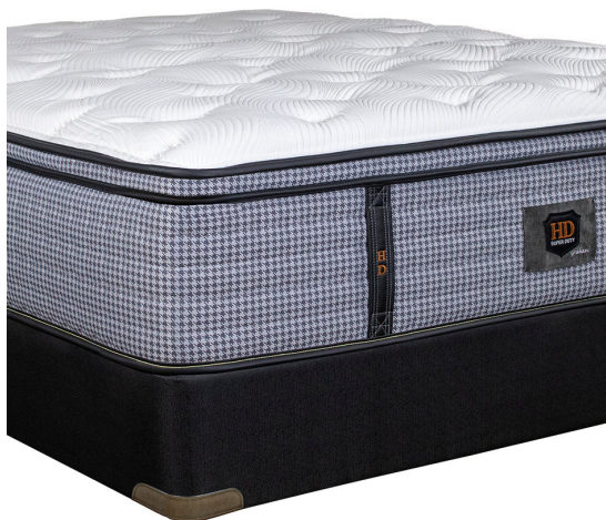
Signature Collection Design