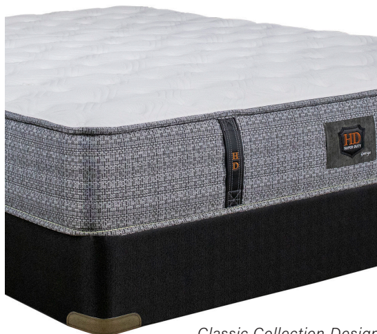
Classic Collection Design

The HD Super Duty collection draws on traditional mattress-making techniques and is available in two series: Classic and Signature. These collections feature heavy cooling knit fabrics, reinforced leatherette handles, wool rosette compression hand tufting and timeless damask border fabrics.